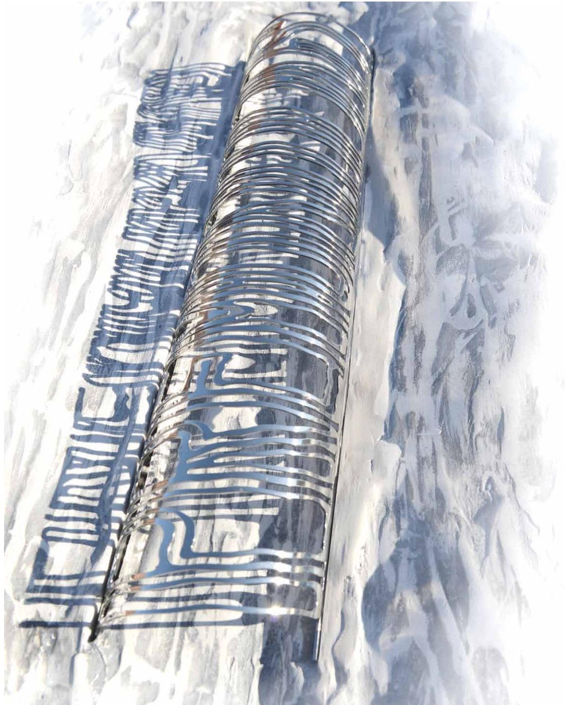
An aerial view of PREMONITIONS.