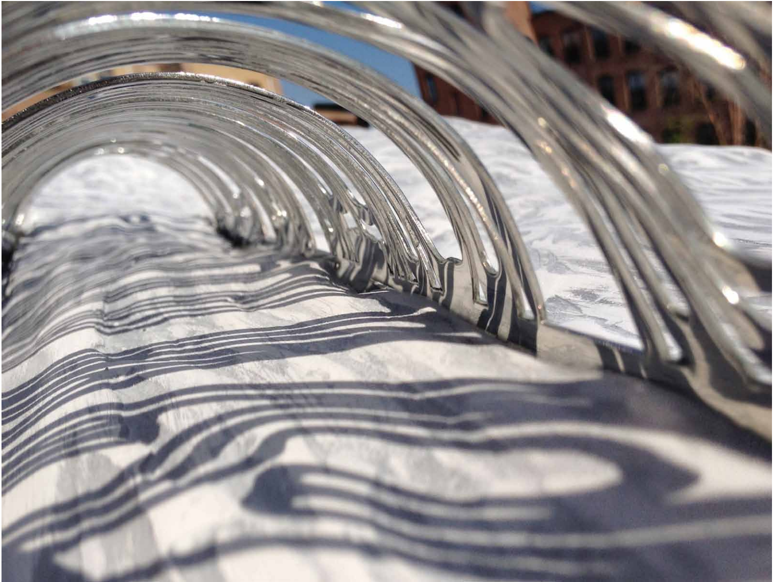
A view of PREMONITIONS from within the tunnel.