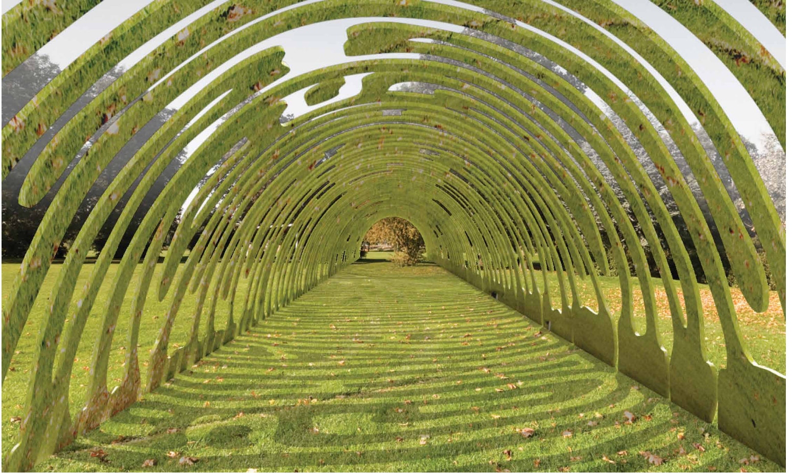
An architectural rendering of PREMONITIONS that emphasizes the reflective nature of the mirrored stainless steel.